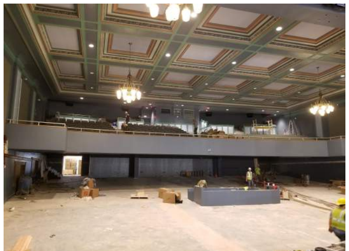
Installation of Auditorium Seating