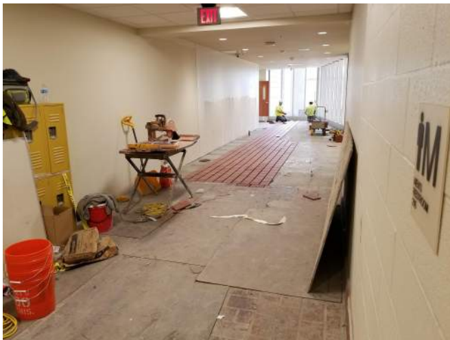
Laying Quarry Tile in Area F 2nd floor