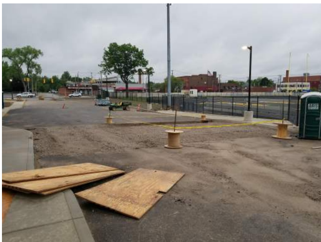
Installation of Crosswalk on East and West Roads