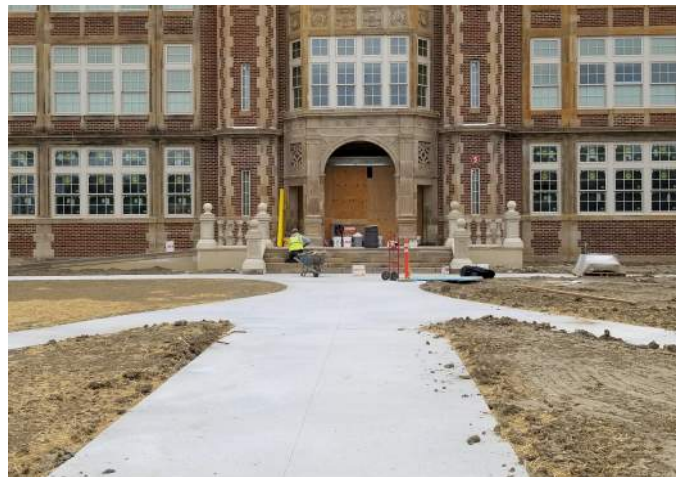
Installation of Stone Rails on Courtyard Entrance