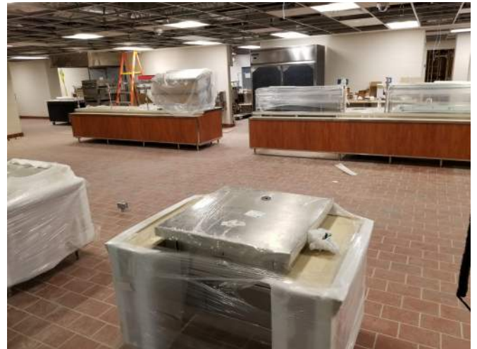
Installation of Kitchen Equipment