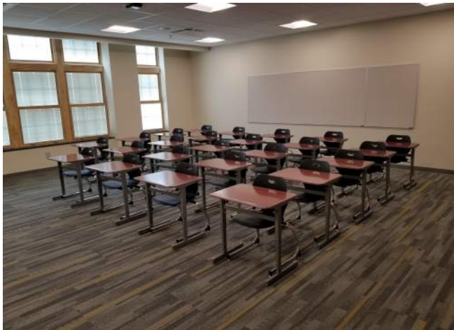
Furniture Installation in Area A 2nd Floor